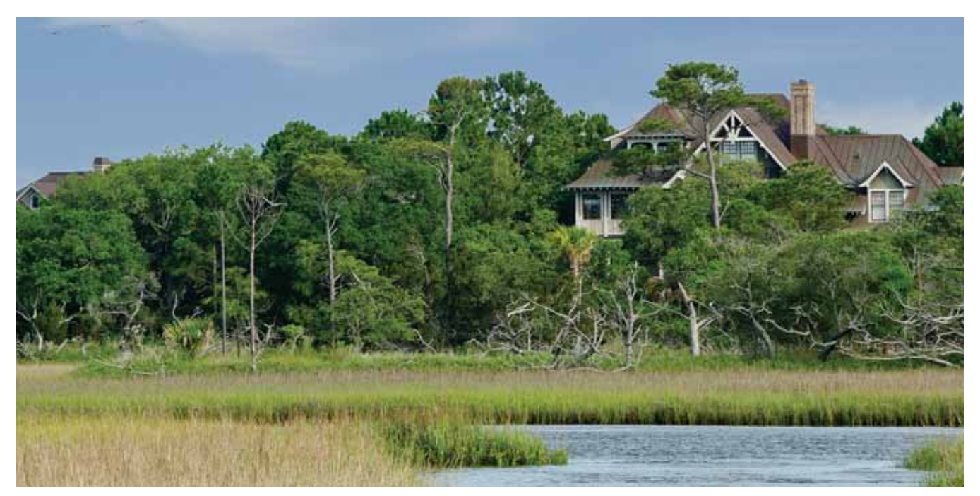
A well screened home maximizes the natural landscape while providing view corridors for homeowners.